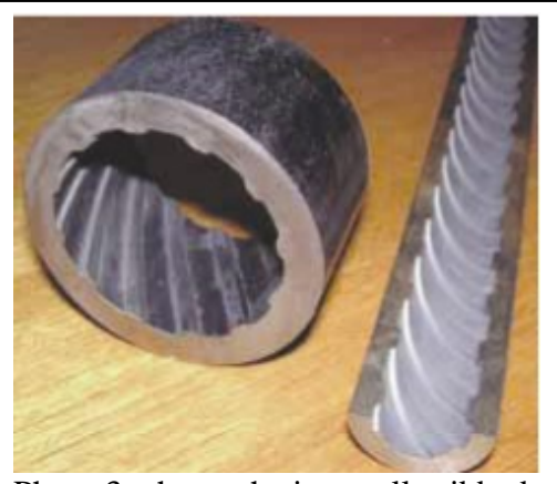
Photo 3- shows the internally ribbed tube / also known as rifle bore tube.