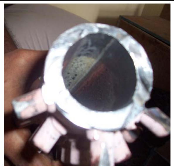
Photo 1- shows the deposition of chemical at top portion of bed tube.